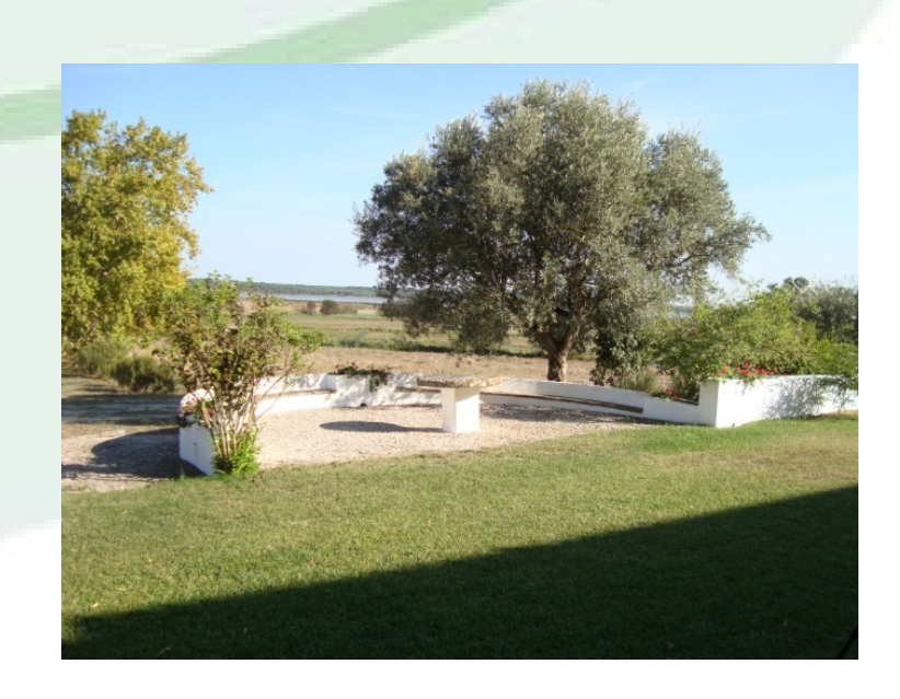
Herdade da Gâmbia