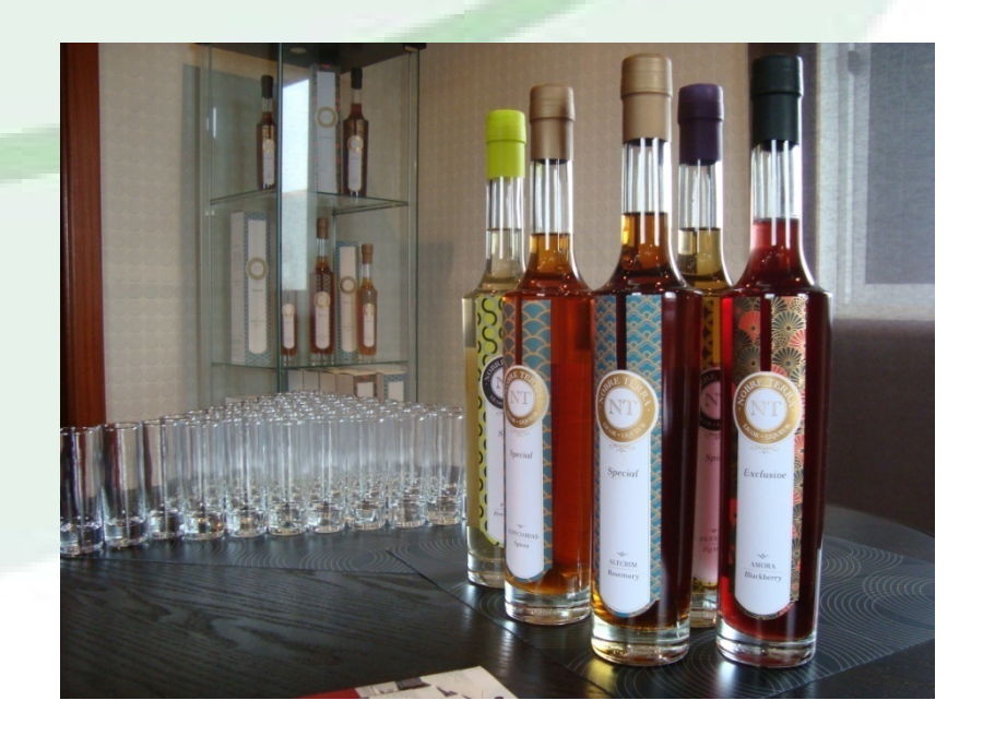
Liqueurs Nobre Terra