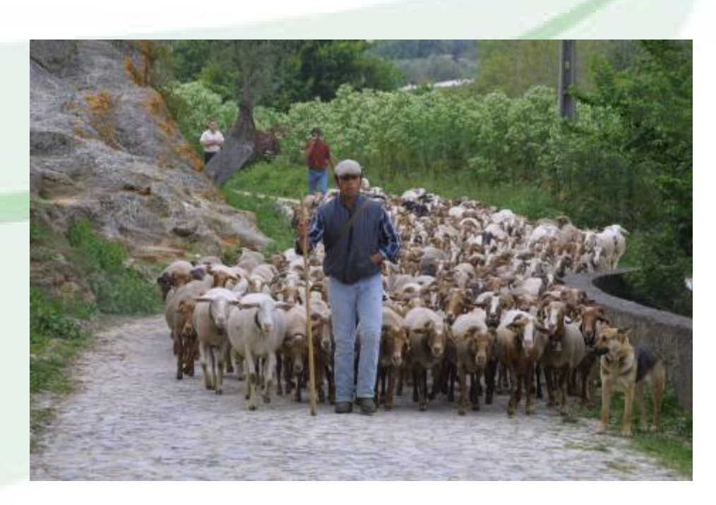
Shepherd with Saloia sheep